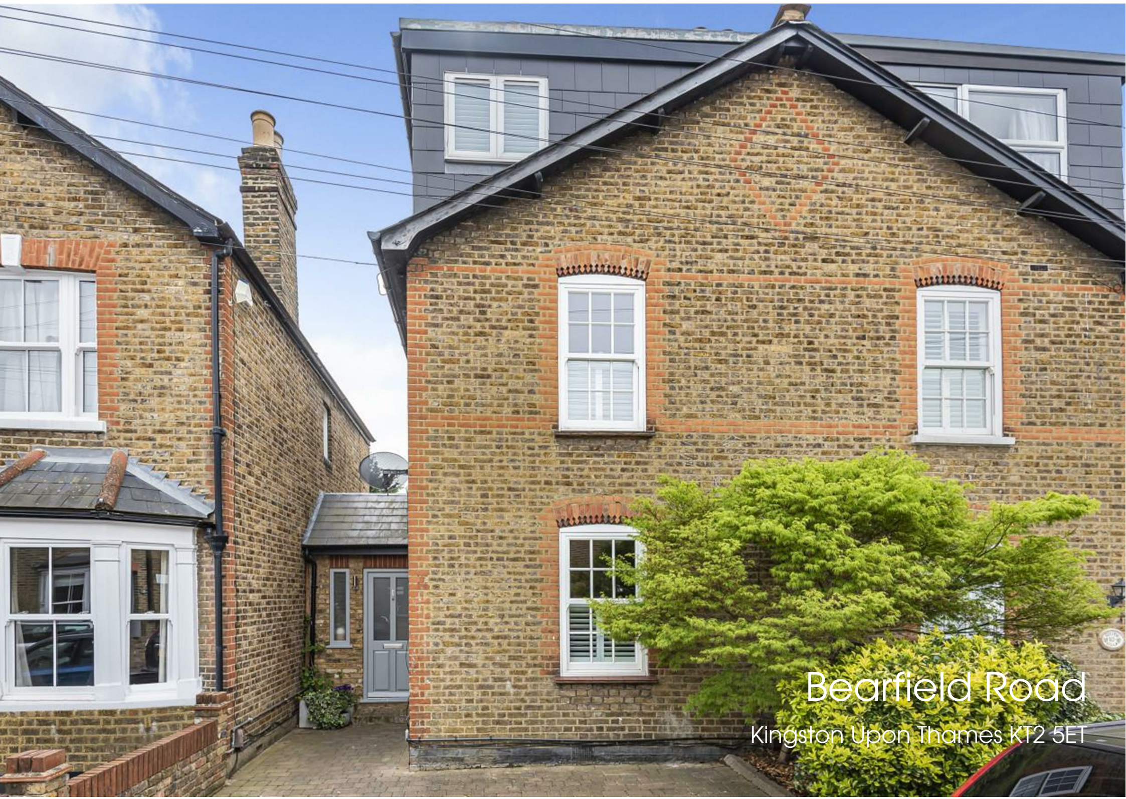
Bearfield Road Kingston Upon Thames KT2 5ET